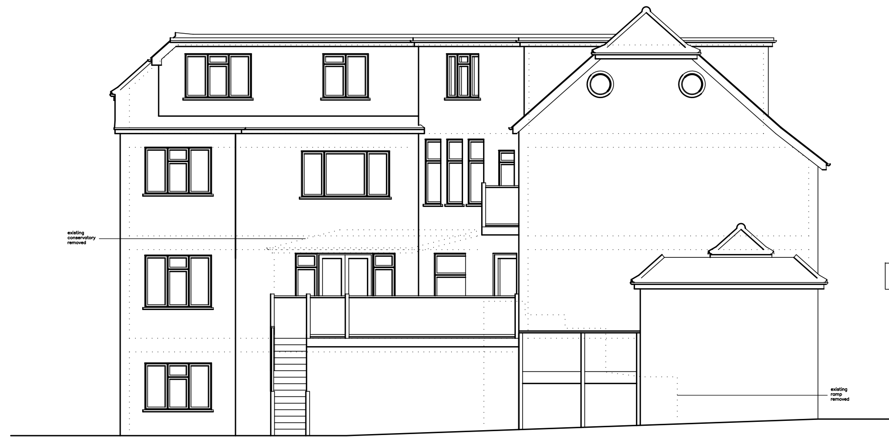
rear elevation scale 1:100