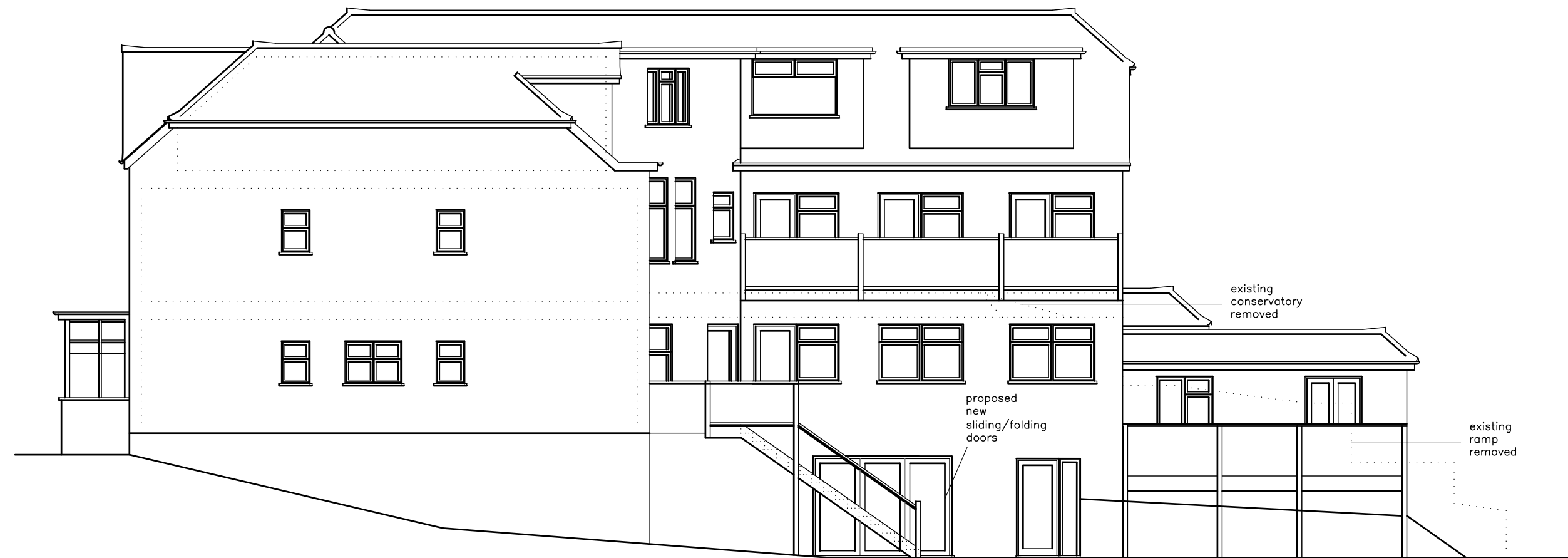
side elevation scale 1:100