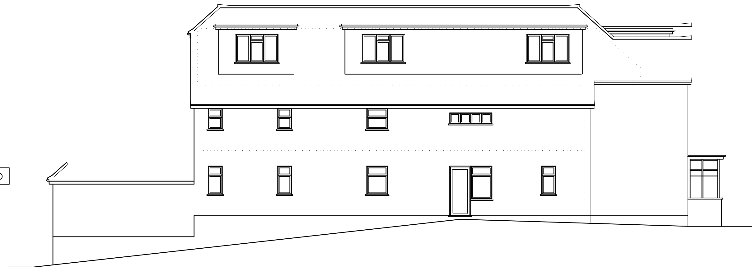
side elevation scale 1:100